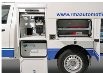
Multiple storage lockers