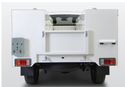
Maintenance roadster body