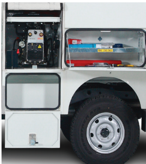
Multiple storage lockers with easy access to equipment