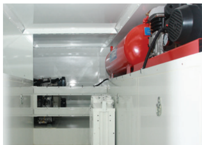
Interior storage for large equipment