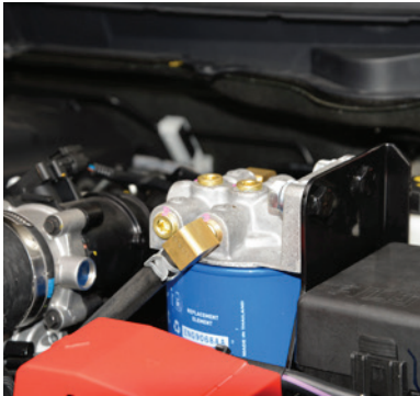
Enhanced fuel filtration system