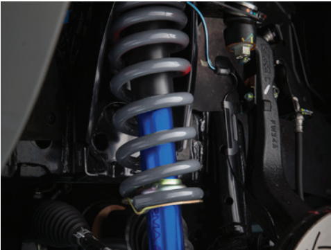
Dynamic suspension (high load)