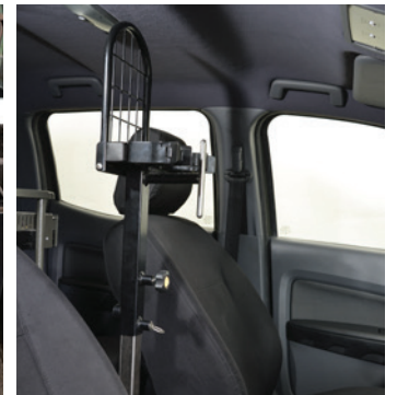
In car rack