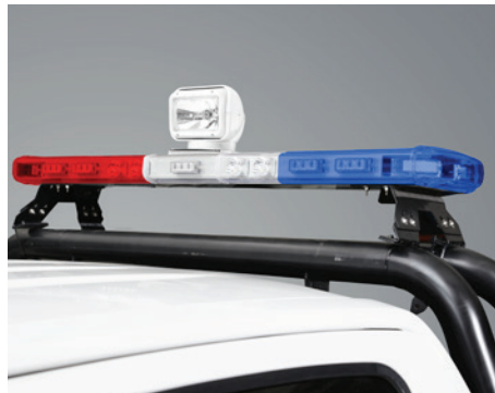
LED light bar