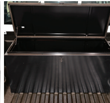
Accessory tool box