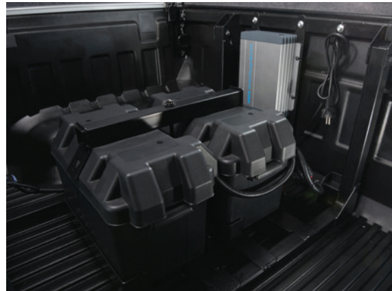
Dual and deep cycle battery system