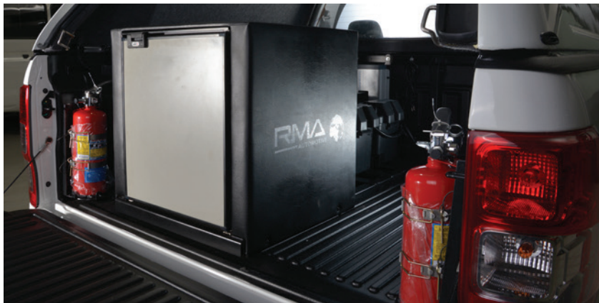
Rail mount fridge