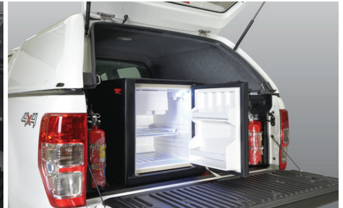
Rail mount fridge