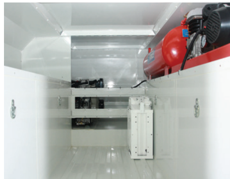
Interior storage for large equipment