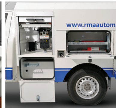
Multiple storage lockers