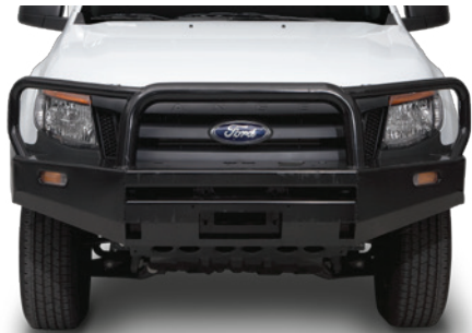
Front protection bull bar