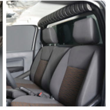
Roll over protection system (ROPS)