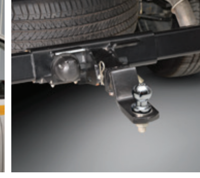
Tow ball with trailer plug