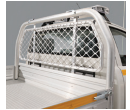
Tubular loadrest with mesh rear window protection