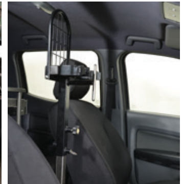
In car rack