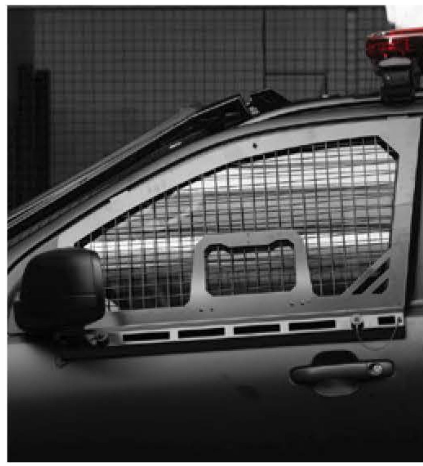
Mesh windscreen and window protector