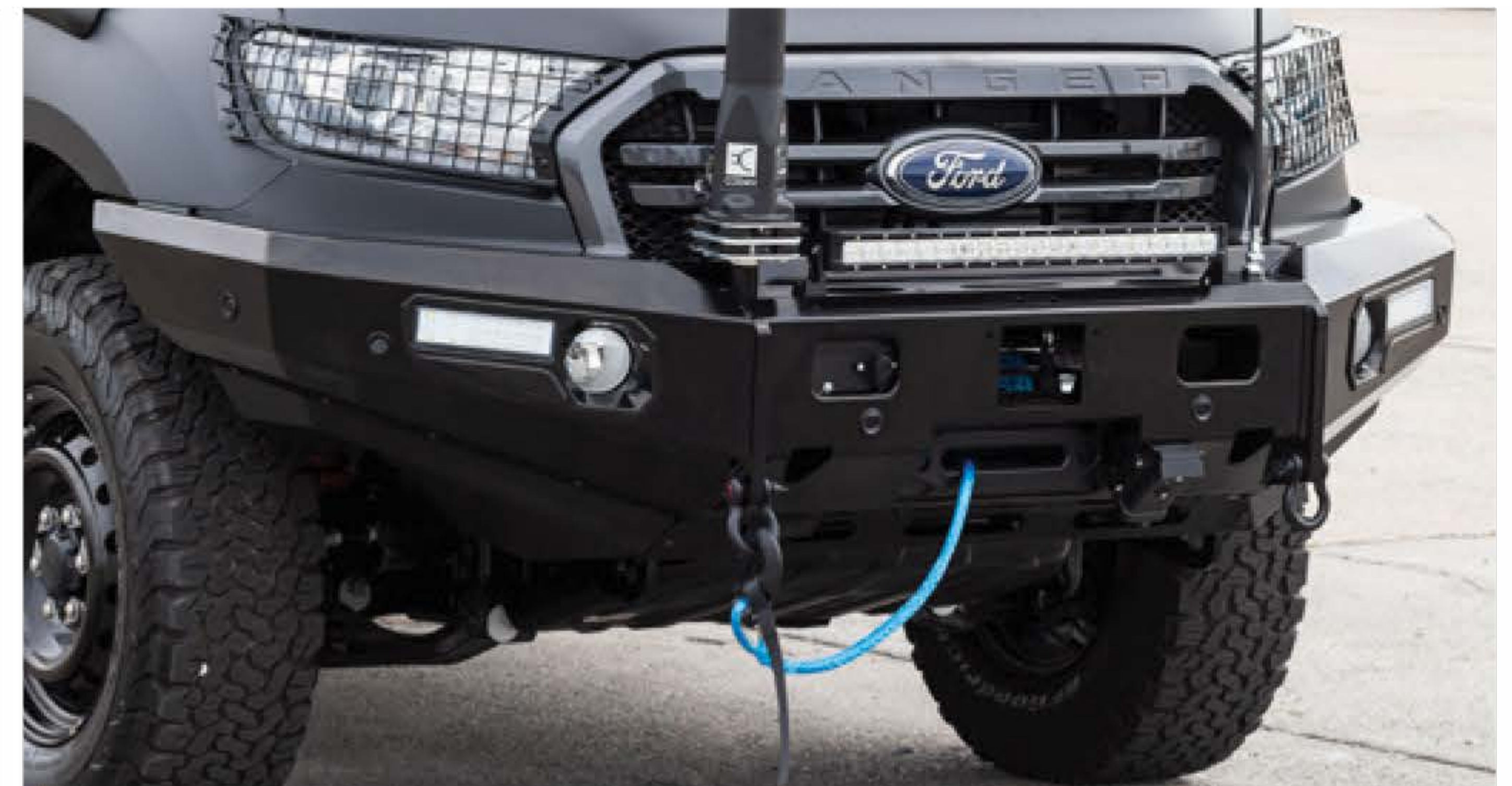
Front bumper with electric winch and LED driving light